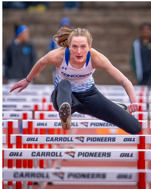
1st Place – Open Special Theme – Unlimited Vision Camera Club

Wisconsin Area Camera Clubs Organization