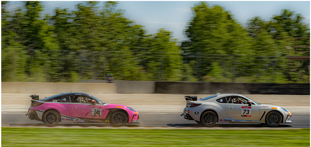
GT Race at Road America